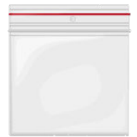
1 Gallon Plastic Bag