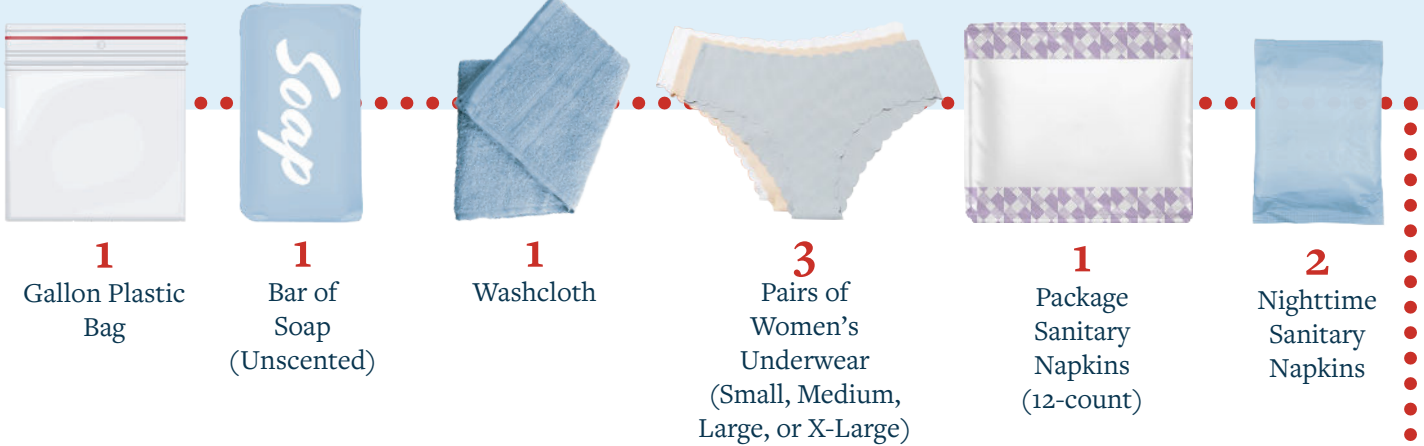
1 Gallon Plastic Bag