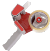
Tape & Tape Guns