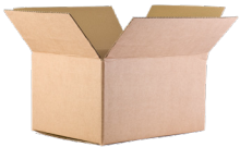
8.25”H x 11”W x 15”L Cardboard Boxes