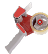
Tape & Tape Guns